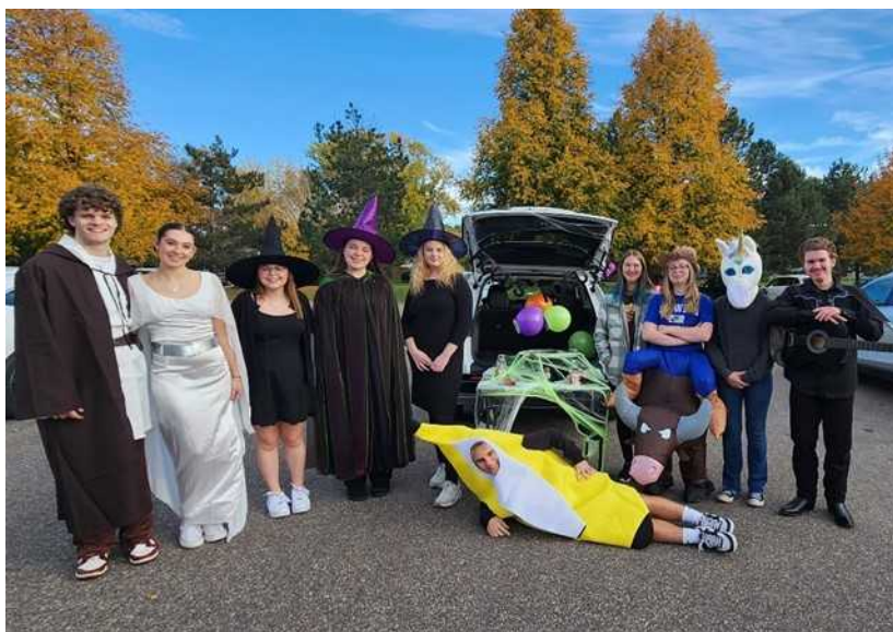
High School Youth Participants