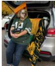
More Photos from Trunk-r-Treat!