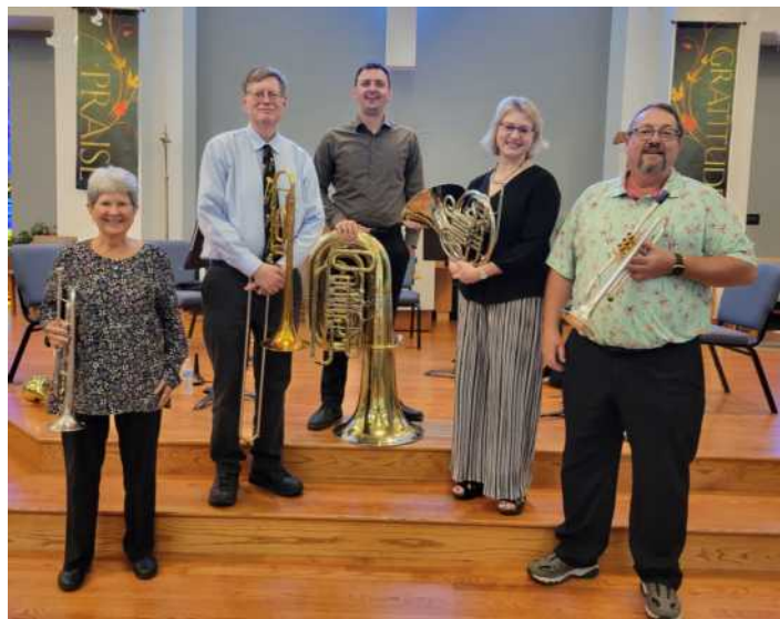
Shown at right: Members of Classic Brass